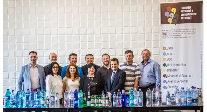
Fig. 2 Romanian First Team of Water/Aqua Sommeliers The role of hydration in the maintenance of health is increasingly recognized. Hydration requirements vary for each person, depending on physical activity, environmental conditions, dietary patterns, alcohol intake, health problems and age.

Generally, as tap water flavor is among the major concerns for water supporters, only a minor percentage is used for drinking, increasing the importance of bottled water composition and flavor. It needs to be kept in mind that consumers assess their tap water primarily by its initial assessment via taste, odor, as well as appearance. However, similar preferences and assessments can be also seen in quality of drinking water produced by for example reverse osmosis or other filtration methods, as well as, for example, when optimizing drinking water taste by appropriate adjusting of mineralization (measured by TDS). In any case, it is important not to forget also about the role of consumer preferences, which are also valid in cases of the mineralization of water, wherein the preference ratings vary. However, it is necessary to uncover taste determinants as it is the initial basis for water industry providers in understanding perceptions and preferences among types of drinking water.