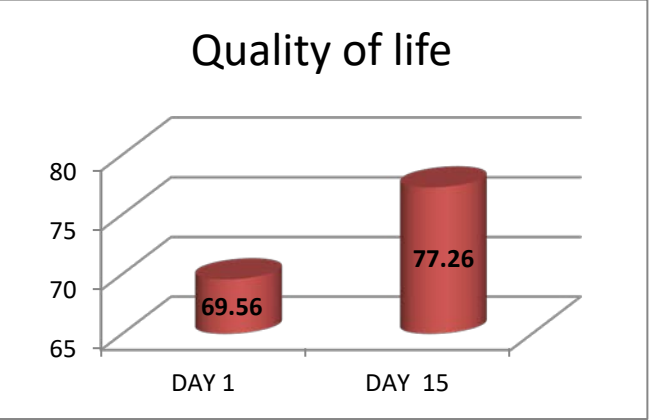
Figure 2: Graphic representation of the means before and after treatment for the QOLS score for group 2

2). The second group of patients were treated in specific natural conditions of Baile Tusnad, in the treatment facility of the Spa Complex, showed also significant improvements in Quality of Life items, as measured by QOLS, with a mean of 77.26 points after treatment compared with 69.56 points before treatment, which is statistically significant: paired T test p < 0.05 (p = 0.0000000000067. (Figure 2)