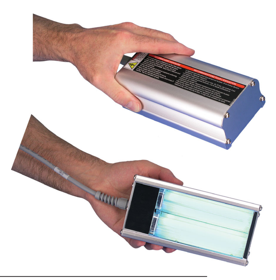
Figure 3 Hand-held phototherapy device (reprinted with permission from Solarc Systems)

The practice of phototherapy dates back to ancient history. In the past century, there have been great advances in delivering targeted therapy in specific wavelengths that have dramatically changed the management of many cutaneous inflammatory dermatoses. Despite the introduction of potent biological agents for the treatment of difficult-tomanage diseases, the cost-effectiveness, ease, and the relatively safe side-effect profile of phototherapy makes it a