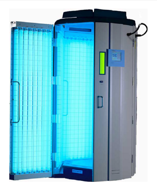
Figure 2 Phototherapy booth

Inconvenience and cost can be curtailed with the use of a home light unit (ibid). Home NB-UVB phototherapy can be as effective as office-based phototherapy, while increasing patient satisfaction with treatment (ibid). Potential side effects and their incidences do not differ significantly between home UVB phototherapy and outpatient pho-